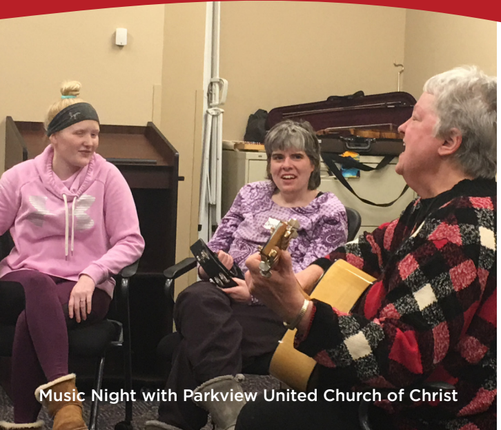
Music Night with Parkview United Church of Christ