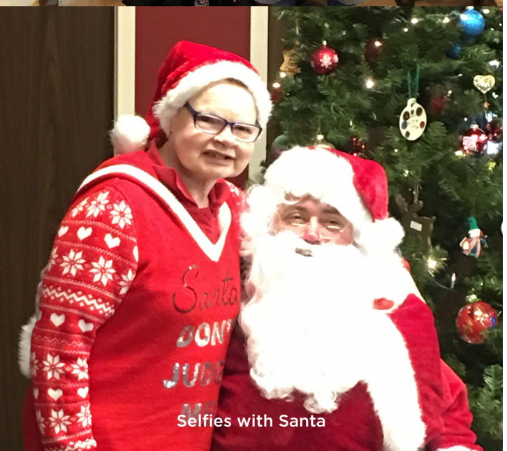
Selfies with Santa