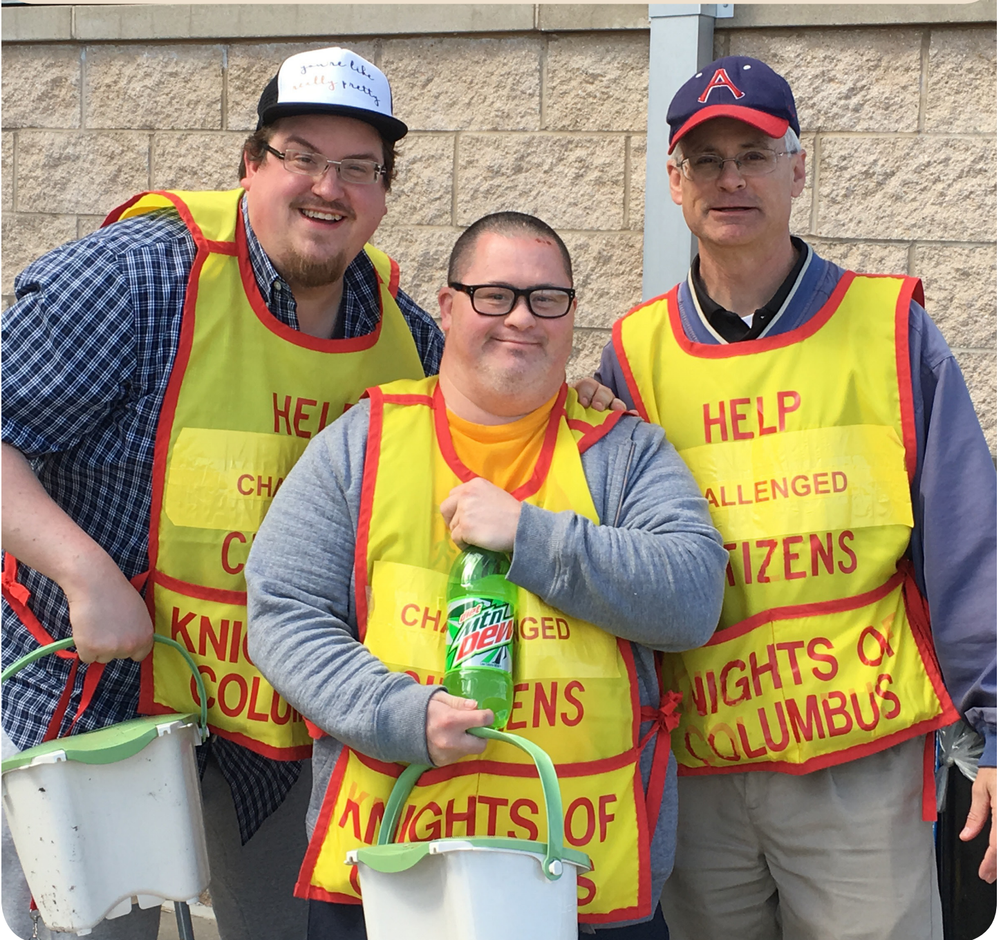
Tootsie Roll Drive - Thanks to the Knights of Columbus for their partnership