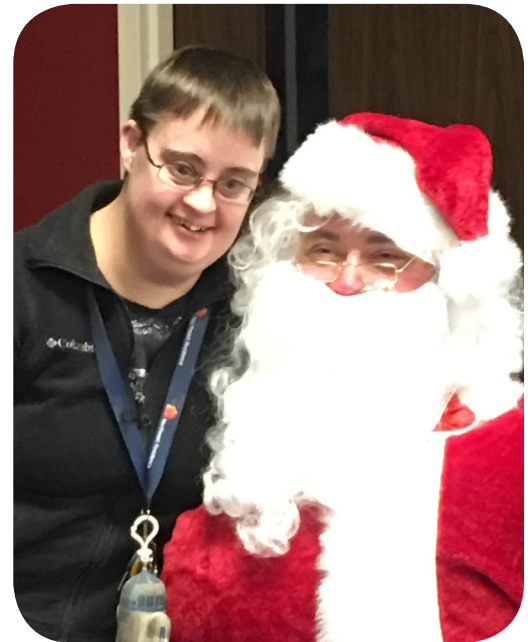
Selfies with Santa