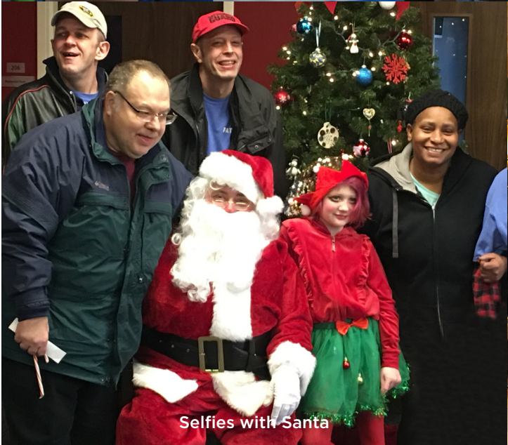
Selfies with Santa